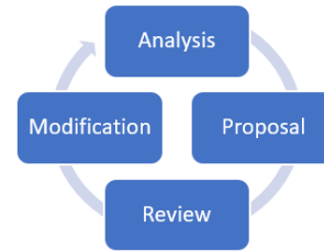
Fig. 3. Scrap sources iterative identification

To generate the necessary base for investigation while performing the analysis, an iterative document review and stakeholder interview-based method can be used to detect all the possible scrap sources.