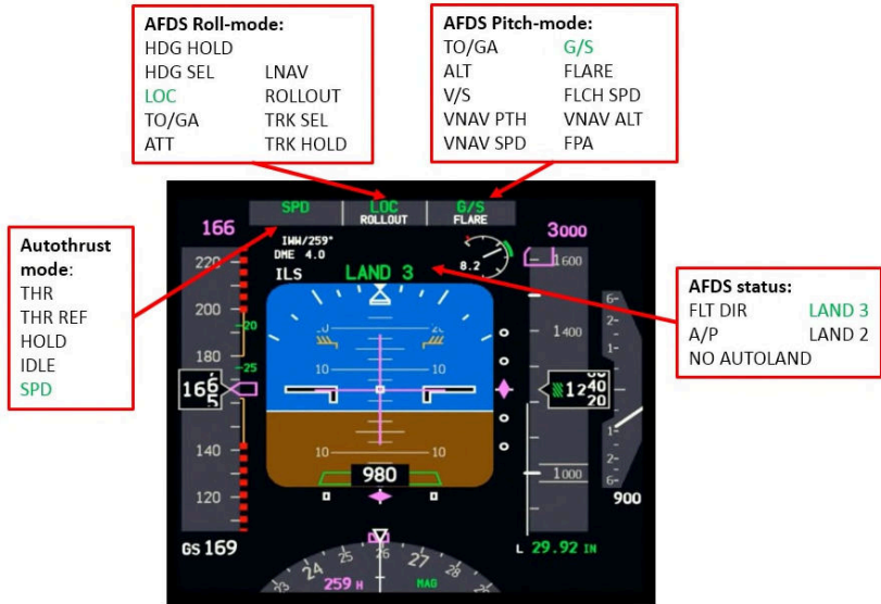
Figure 1: The complexity of information behind the FMA in the primary flight display of B-777 flight deck

whether the autothrust or the pitch-mode is controlling airspeed, they have to conduct the following tasks correctly: (1) read the FMA autothrust column text; (2) interpret the text to see if the autothrust is controlling the airspeed (as there are modes that cause the autothrust to be “engaged”, but not controlling the airspeed, e.g. “HOLD” or “THR”); (3) if the text is anything else other than “SPD” (i.e. the autothrust is not controlling the airspeed), the scanning continues to the pitch-mode which may be controlling the airspeed in a climbing or descending scenario; (4) interpret the pitch-mode (check if it is FLCH SPD or VNAV SPD- the so-called “ airspeed on pitch ” modes); (5) check the AFDS status indication, to ensure that the autopilot is engaged in case of airspeed being controlled via the pitch-mode.