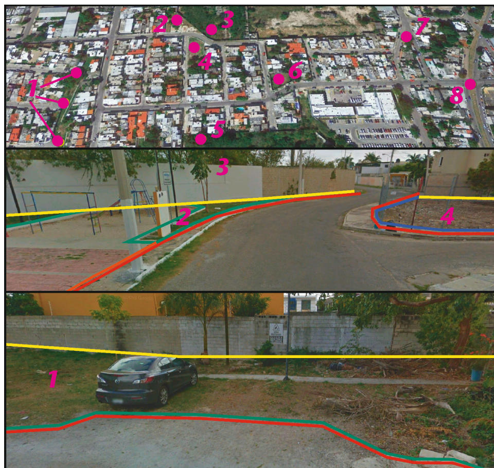
Figure 2. We exemplify how soil edge mapping could be applied, using a number of occurrences of urban soil in the Roma neighbourhood of Mérida, Yucatán. The numbers in the top aerial photograph indicate the following urban soil situations: (1) soils found in the margins of built space, presumably public space, which are highly accessible and especially proximal to residents of the adjacent street; (2) publicly accessible soils, part of a park and playground maintained by the municipality; (3) soil contained as part of the grounds of an educational institution, which would be at times accessible through membership of the educational community and may be maintained in part to serve specific activities; (4) soil contained on an as yet undeveloped private and fenced plot, inaccessible to the public; (5) soil supporting an area of vibrant vegetation, devoid of clear access ways, surrounded by development, it is unclear if this is private or public land; (6) soil contained in a privately run parking lot, to which the public have paid access, but not to engage with soils, which sole purpose may be to support grass vegetation to keep the area neat; (7) soil supporting select trees and vegetation as part of gardens may look deceptively green while concealing that the soil itself is virtually sealed unto the stems of that vegetation; and (8) soil wedged in between a major traffic artery (part of a disused railway), which is highly accessible to any member of the public when traversing, but remains underused. The lower parts show the street scenes of situations 1–4. The yellow edge indicates the inaccessibility of urban soils due to impermeable walling. The green edges indicate publicly accessible soils without physical restrictions. The orange edge indicates sealed soil with some permeability (here, tiles or sand). The blue edge indicates visible yet inaccessible soil as part of private land. The red edges indicate impermeably sealed soils by concrete and tarmac surfaces, only mitigated by cracks formed by ageing. (Background images credit: Google Earth © 2023).

variety in properties indicates qualitative differences in habitual soil connectivity opportunities in the urban built environment. Furthermore, systematic edge mapping would enable the study of the lineage of their occurrence and performative roles throughout the development of urban built environment configurations (e.g., in densification and land cover intensification processes).