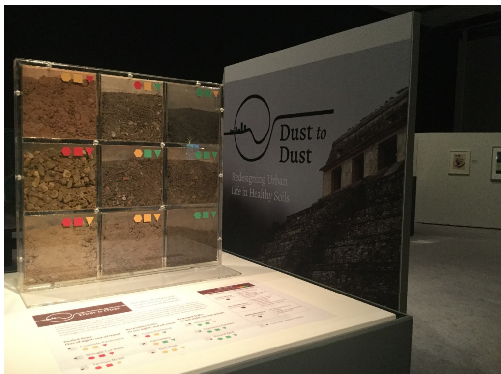
Figure 3. The soil display opening the Dust to Dust: Redesigning urban life in healthy soils exhibition at the Sainsbury Centre, Norwich, UK, which generates public awareness that productively used urban soils have the most beneficial properties.

source of inspiration for sustainable urban design responses. Soil specialists collaborated with other (urban design and planning) stakeholders to offer potential holistic solutions for negotiating conflicting land-use interests and developing habit architectures. The results communicated the significance of the links between urban design, cultural values and habitual soil engagement, and soil quality for achieving urban soil security to a general audience. Finally, all multidisciplinary design ideas stressed both the active participation of urban inhabitants in productive relations with the urban environment and their conscious engagement with cultural and individual values. We are hopeful that the proposals achieved in collaboration with urban practitioners can ultimately find a way to implementation in planning and design.