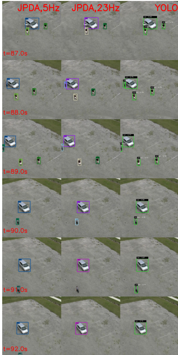
Fig. 4. Detection and tracking in an aerial video

The YOLO+JPDA algorithm is also tested on UAV aerial videos [16] (also with original and 5 FPS video) to assess its robustness for possible disturbances during UAV flight like vibration, image blurry, FOV temporary lose, too small target due to high altitude, etc. The video is obtained from UCF-Lockheed-Martin UAV Dataset. From the result in Fig.