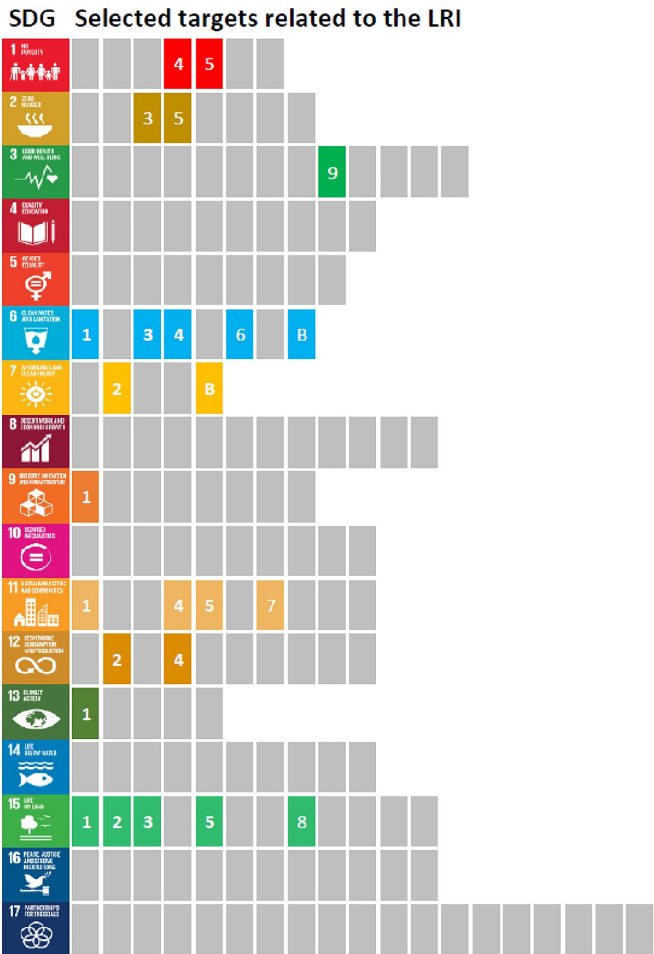
Fig. 2 Illustration of all selected SDG targets that call for action in the LRI specifically related to hydrological, geomorphic, and/or ecological processes

beds to straighter channels with lower geomorphic activity (Grabowski et al. 2014). These changes can be caused by the presence of flow regulating infrastructure and resulting changes in sediment transport and channel incision (Brandt 2000), agricultural embankments (Fuller et al. 2019), or a compounding effect of several factors (Surian and Rinaldi 2003). These human-induced alterations to river form and surface water connectivity with floodplains can make the