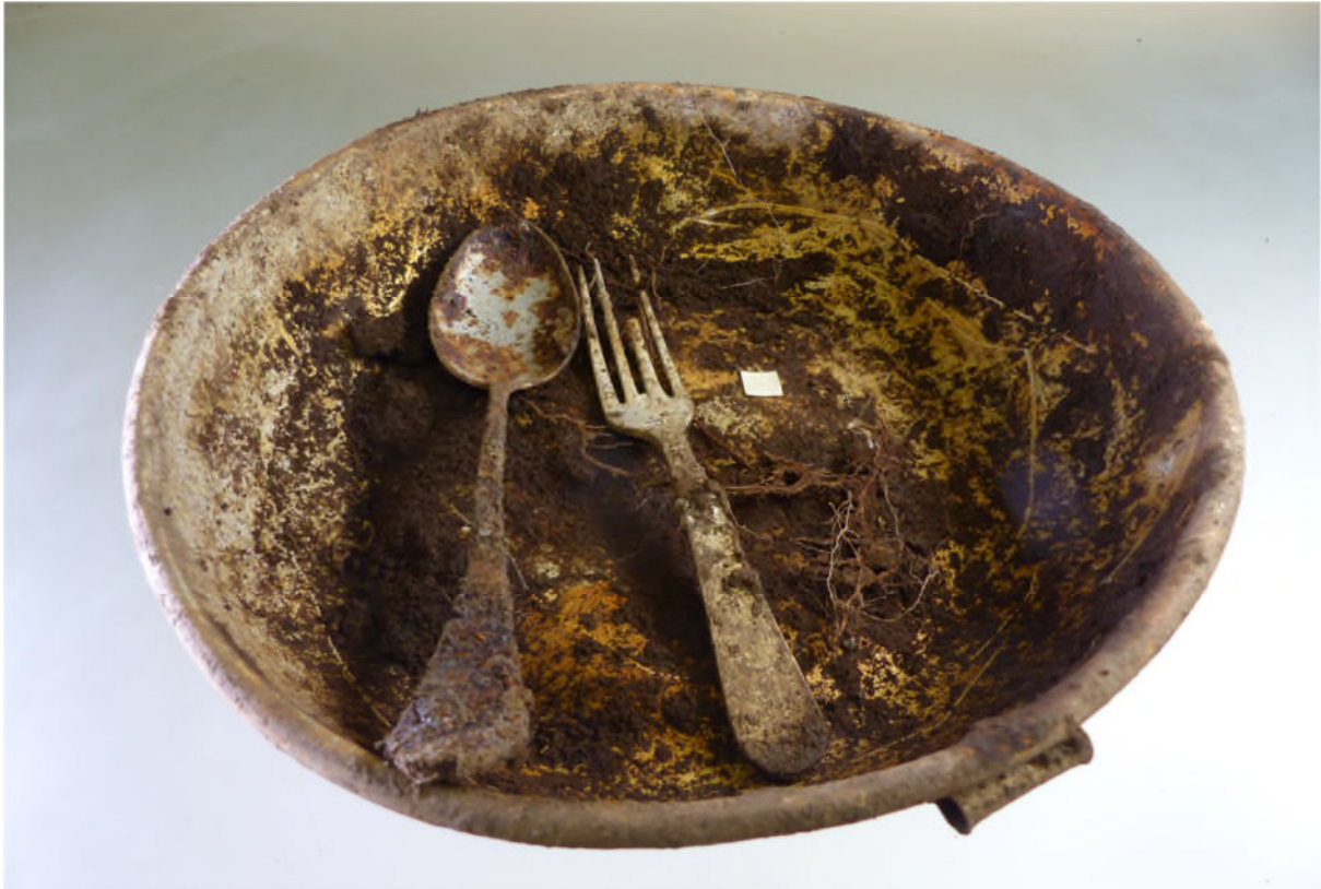
Figure 9. Plate, spoon and fork recovered from Monte Altun, as found.

Individual 4 was in a supine position with the left arm flexed above the head. The lower limbs were flexed because they presented perimortem fractures (Figure 10). Due to the incomplete fusion of the clavicles, an age-at-death of less than 25 years was estimated. This soldier carried a bent iron spoon, a belt with a buckle, several silver coins issued by the Government of Euzkadi in 1937, a fragment of mirror and a perfectly preserved helmet. Several bones of the upper and lower limbs evidenced peri-mortem diaphyseal fractures. In this case, an identification disc was not located, but with the existing documentation available on the list of casualties buried there, the identification by the anthropologist was thought to be that of V.F.S., which was also confirmed later by DNA analysis.