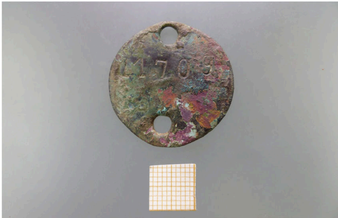
Figure 8. Identification tag number 11709 corresponding to soldier P.G.G.

The body of Individual 3 was lying on its right side, with the right leg flexed below the left. Anthropological analysis in the laboratory provided an age at death for this male individual as less than 25-30 years. Among the objects recovered in relation to him, there were a belt, buttons, boots, an aluminium plate, a spoon and fork (Figure 9), a mouthpiece of a wine boot, part of a canteen, a cartridge clip and an identification tag with the number 12875. This soldier belonged to the same battalion as the previous two individuals.