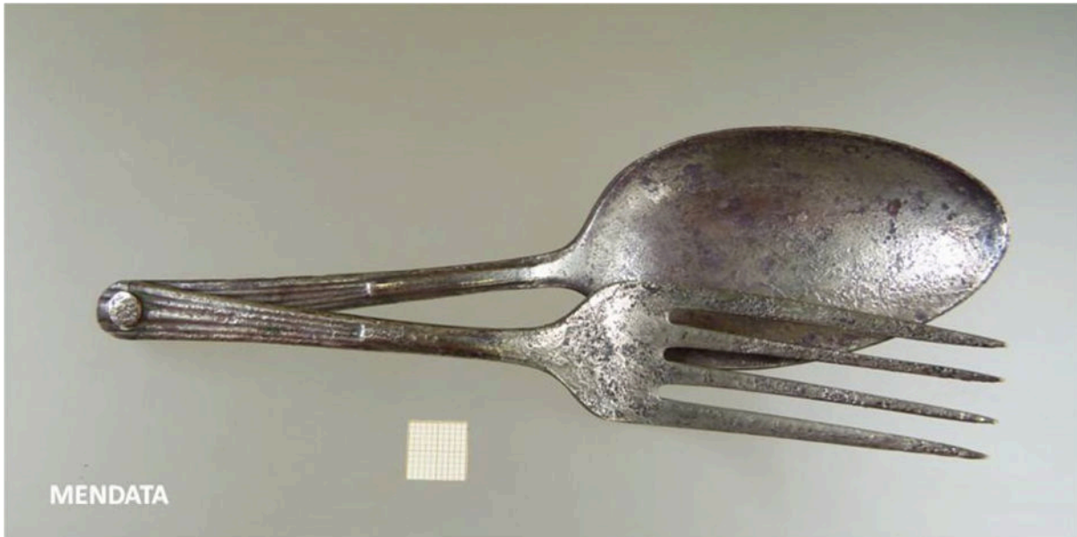
Figure 5. Set of nickel silver spoon and fork from Mendata (Bizkaia).