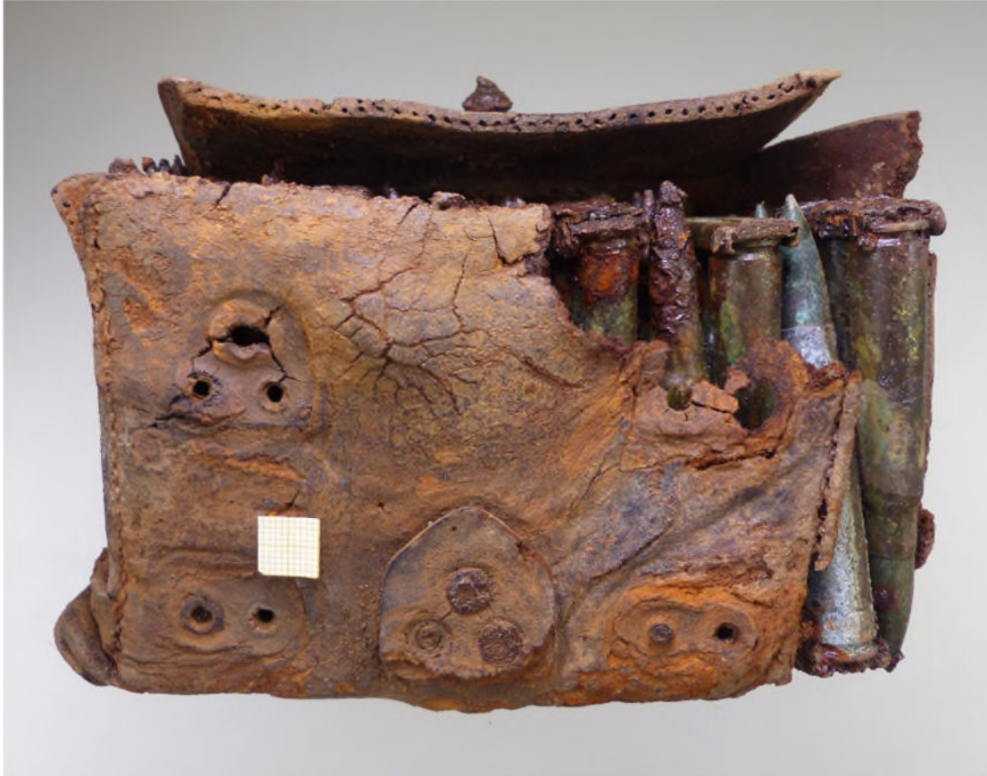
Figure 11. Restored holster with ammunition.

Finally, the skeletal remains of Individual 5 were affected by the roots of a pine tree that had grown through the bones, causing fragmentation and erosion. Associated with this individual were two complete cartridge belts (Figure 11), in addition to straps, belt, buckles and boots. He was identified as J.M.A.R.