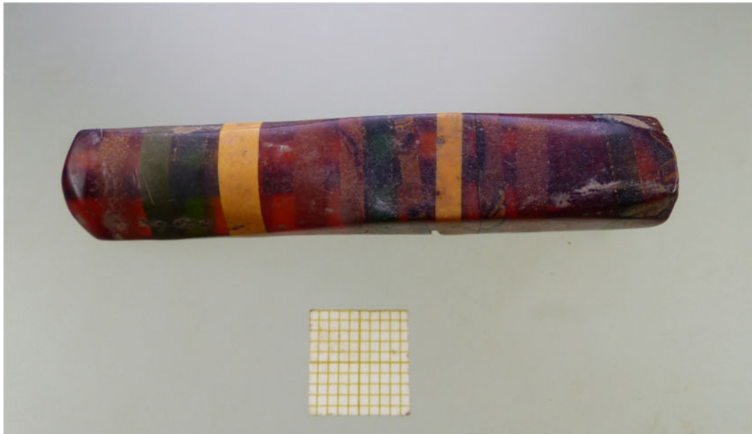
Figure 7. Coloured cigar mouthpiece. Mount Altun Trench.