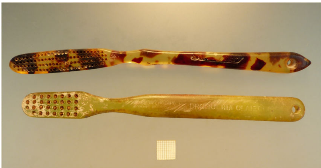
Figure 4. Toothbrushes recovered from a trench in Zelaietaburu (Elgoibar, Gipuzkoa).

With regard to use of trenches as a favourable place to dispose of the bodies, one case investigated by SCA can be mentioned here. This relates to the exhumation of three combatants in a trench in Zelaietaburu (Etxebarria, Bizkaia), who died in the first days of April 1937 13 . The informants mentioned that the trench line had been used to bury three soldiers. These individuals were found arranged in a row in a supine position. The skeletal remains were in a poor state of preservation due to the humidity and the action of the roots of the tree cover and this limited the anthropological analysis. Nevertheless, a removable upper arch dental prosthesis was found in one individual, whilst another individual had two yellow celluloid toothbrushes in the top right pocket of a jacket, one of the brand "Sanitas" and the other of English import with the words: "Made in England. Pure Brush" (Figure 4). The human remains of the other soldier (Individual 3) was in a poor state of preservation as they were found in the middle and deepest part of the trench.