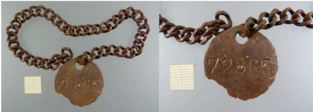
Figure 2. Bracelet with identification disc number 72865. Lemoatx (Bizkaia).

Basque Government coat of arms, leather footwear, as well as a set of objects that could be stored in a backpack including espadrilles, a fountain pen, two razor blades, two brass spoons and a hand grenade. However, the most significant item was a link chain bracelet on the left wrist. From this bracelet hung a metal disk with the number 72865 engraved (Figure 2). After consulting in the Basque National Archive in Bilbao the list of payrolls of the different battalions, it was discovered that the number corresponded to a young adult male with the initials HRB, who belonged to the Socialist Battalion No. 28 of Barakaldo (Bizkaia) [26].