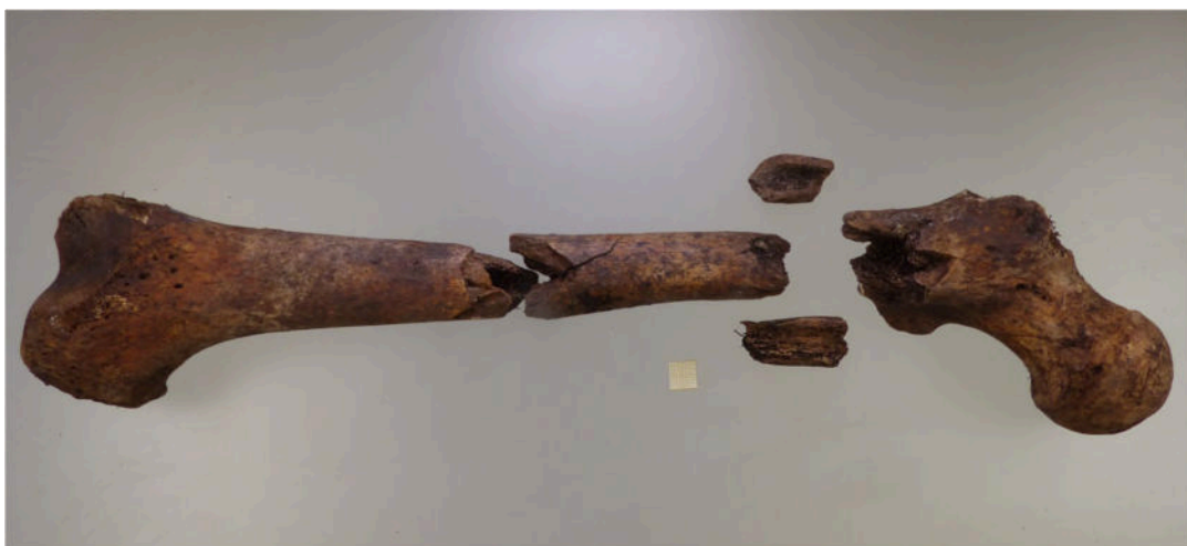
Figure 10. Peri-mortem fractures to the right femur at the level of the proximal third and the middle third of the shaft.

Individual 4 was in a supine position with the left arm flexed above the head. The lower limbs were flexed because they presented perimortem fractures (Figure 10). Due to the incomplete fusion of the clavicles, an age-at-death of less than 25 years was estimated. This soldier carried a bent iron spoon, a belt with a buckle, several silver coins issued by the Government of Euzkadi in 1937, a fragment of mirror and a perfectly preserved helmet. Several bones of the upper and lower limbs evidenced peri-mortem diaphyseal fractures. In this case, an identification disc was not located, but with the existing documentation available on the list of casualties buried there, the identification by the anthropologist was thought to be that of V.F.S., which was also confirmed later by DNA analysis.