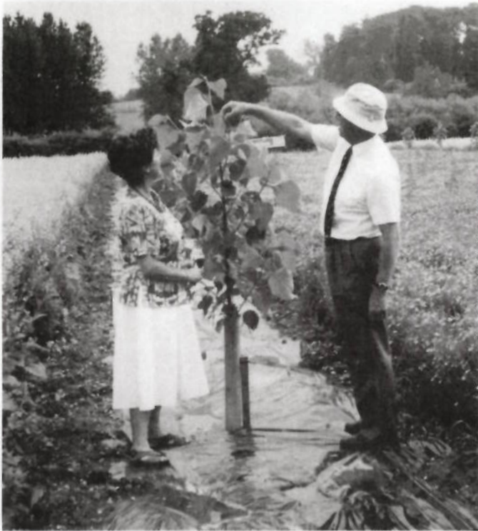
Figure 3. Silvoarable demonstration at Royal Show, Stoneleigh Park, Warwickshire. Alternate alleys are cropped with oilseed rape and linseed. Note the plastic mulch and first year growth of P. "Beaupre" from unrooted set.

system would be eligible for Arable Area Payments. Assuming a distance between tree rows of 20 m, and 5 m between trees in the row, only 100 trees ha -1 will be planted. Poplars grown at that spacing on land to Yield Class 18 (YC 18) will produce approximately 300 m 3 of timber in 30 years giving a tax-free return of about £7,500 ha -1 . Thomas and Willis (1998) and Burgess ( pers. comm. ) have analysed the relative profitability of the silvoarable system with poplars compared with arable cropping. Their studies indicate that silvoarable systems are profitable. However their profitability relative to arable cropping is dependent on land quality, crop prices and the grants and payments available to growers. Currently, agroforestry is penalised by both WGS and FWPS and they suggest a re-examination of these schemes so as to encourage the perceived benefits from silvoarable agroforestry.