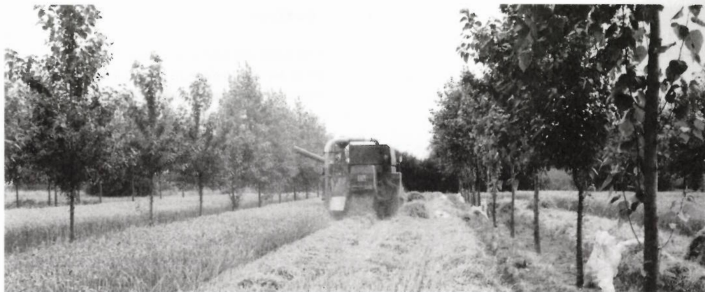
Figure 1. Winter wheat harvest with rows of poplar 10 m apart in the 5th growing season. Silsoe College, Bedfordshire (Cranfield University).