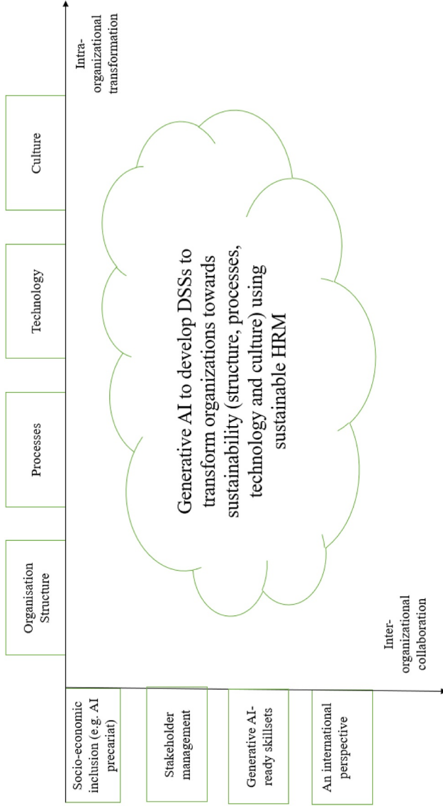
FIGURE 6 Research scope of generative AI to embed sustainability within organizations through sustainable HRM. [Colour figure can be viewed at wileyonlinelibrary.com ]