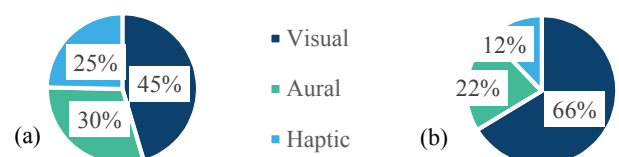
Figure 2. Testers' solutions ranking for (a) case study 1 and (b) case study 2.

The consistency analysis for case study 1 and 2 are presented in Figure 3.a and Figure 3.b, respectively. Each graph shows the Consistency Ratios (CR) for each of the 33 pairwise comparisons conducted by testers. Only few are above 10% (inconsistent), but the case study means are 3.3% and 3.5% respectively. Thus, the results can be considered consistent. Still, these differences could be explained by the different backgrounds from the decision-makers involved in the process.