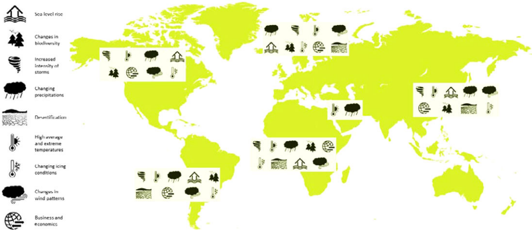
Figure 2. ICAO 2019 International Climate Change Risk Map.

Thirty percent of corresponding nations already had implemented some climate change adaptation measures, another 25% were planning to do so within ten years, and only 6% of states had no such plans. There is a general accord amongst respondents and expert authors that present adaptations are inadequate. Based upon responses, ICAO created a risk map, reproduced in Fig. 2.