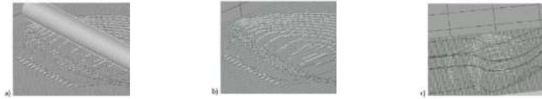
Figure 0-1: Equilibrium scour bed profiles presented with or without cylinder and selected streamlines.

It was claimed that for a pipeline laid on the seabed, for every 35 feet installed 1 foot was spanned initially and after five years of operation, for every 15 feet installed, 1 foot was spanned. The free-span length is governed by the following effects: