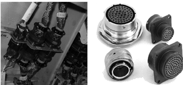
Figure 2: Connectors applied at a wiring harness production break

Electric aircraft wiring harnesses can be comprised of hundreds of cables and ten thousands of wires, providing connectivity between all the mission and vehicle systems ensuring sufficient redundancy and reliability. Electrical