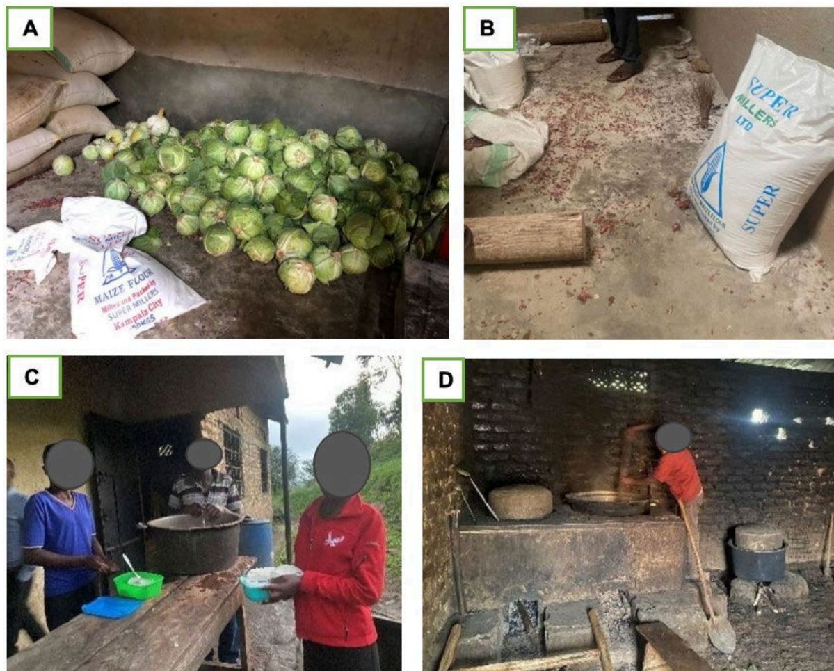
Figure 2. (A) to (D) represents appalling food storage and handling practices