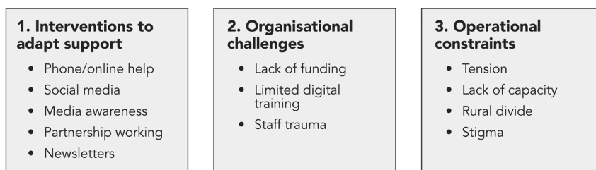
FIGURE 2 Adaptability of farmer mental health support during the COVID-19 pandemic

modified version of a framework by Scheirer and Dearing (2011), 2 we assess the adaptability of the UK landscapes of support for farming mental health during the COVID-19 pandemic. Using a similar three-point framework, we assess (1) the interventions used to adapt support during the pandemic, and how (2) organisational challenges and (3) operational constraints affect the ability of the landscapes of support to adapt through and beyond times of crisis (Figure 2).