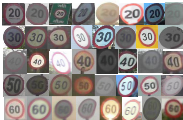
Figure 1. FSLSD is obtained by annotate in the original image

The Databases of speed limit sign used in our experiments include 587 samples, which are collected by us on a variety of different roads in the United Kingdom. It includes city streets, countryside, high ways, various luminous environments and positions. Most of samples have a complex background with various target sizes. Two data set were produced as follows: a. the first speed limited sign data set is the original images, denoted as FSLSD as shown in Figure. 1; b. the set of black-and-white traffic speed limit sign extracted from original images with the BAMC algorithm, denoted as the second dataset (SSLSD) in the second line of Figure. 2. From 587 samples, we have chosen 59 samples with different sizes, 52 light-blurred samples, and 46 positions tilted samples for experiment assessment.