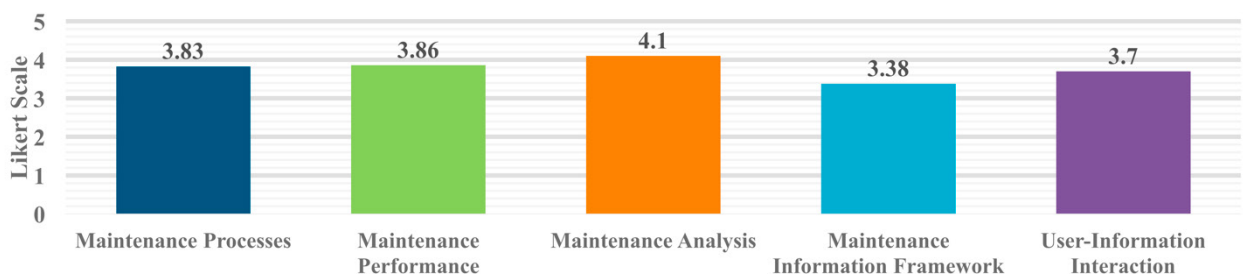
Figure 3. Survey questionnaire results

The questionnaires included several statements about each topic, allowing the experts to reply about their agreement with them using a 1-5 Likert Scale. Their results are provided in Figure 3.