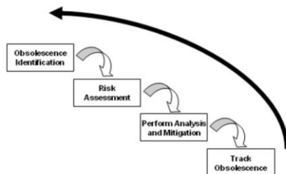
Fig. 3. Offshore Oil and Gas obsolescence mitigation strategy [12]

Obsolescence risk assessment is essential to manage obsolescence effectively. Although there are standards to manage obsolescence, such as the JSP886 Vol. 7 Part 8.13 and EN 62402:2007, none of them define explicitly a process to assess the risk of obsolescence that can be systematically used by industry. Risk mitigation is facilitated by evaluating the likelihood of obsolescence and its impact, which requires quantitative analysis. Figure 3 explains a number of steps that could be considered in an obsolescence management plan (OMP). An OMP is a proactive approach/methodology to address obsolescence and help to predict, detect, quantify, mitigate and report in the most cost effective way and timely manner and guidance for obsolescence management for system life cycle support [11].