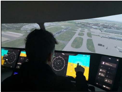
Figure 1. FSS flight deck consisting of PFD, Navigational Display and Multi-function Display

The primary apparatus used was the Future Systems Simulator (FSS) designed by Cranfield University in partnership with Rolls Royce (Figure 1). Touchscreen displays were: 1) Primary Flight Display (PFD); 2) Navigational Display, and; 3) Multi-function Display (operating autopilot altitude, heading and speed control, and fuel management). The simulator used Air Traffic Control (ATC) 'callouts' features. The FSS simulated the Gulfstream G500 aircraft during the experiment.