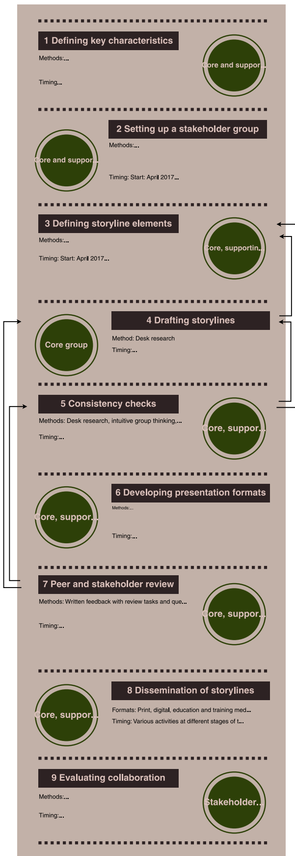
Fig. 1. Overview of the research process based on the nine working steps defined in the protocol by Mitter et al. (2019). Notes: For each working step (grey rectangle), the scenario working groups involved (green circles), the applied methods and the timing are given. The arrows indicate that the research process was iterative, i.e., some working steps were repeated until the final Eur-Agri-SSPs were developed. (For interpretation of the references to colour in this figure legend, the reader is referred to the web version of this article.)

data and resources. Additional information and material for specific working steps is provided in the Supplementary Material (SM II) .