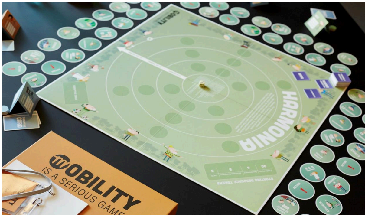
Figure 3: The "Harmonia" board for "Mobility is a serious game"

Challenges: simplification and shortening of the sessions