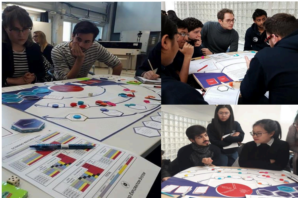
Figure 6: Master students exploring scenarios for sustainable businesses

about sustainability, but also offered examples and inspiration of how to apply sustainability in the multi-faceted social context of the real world.