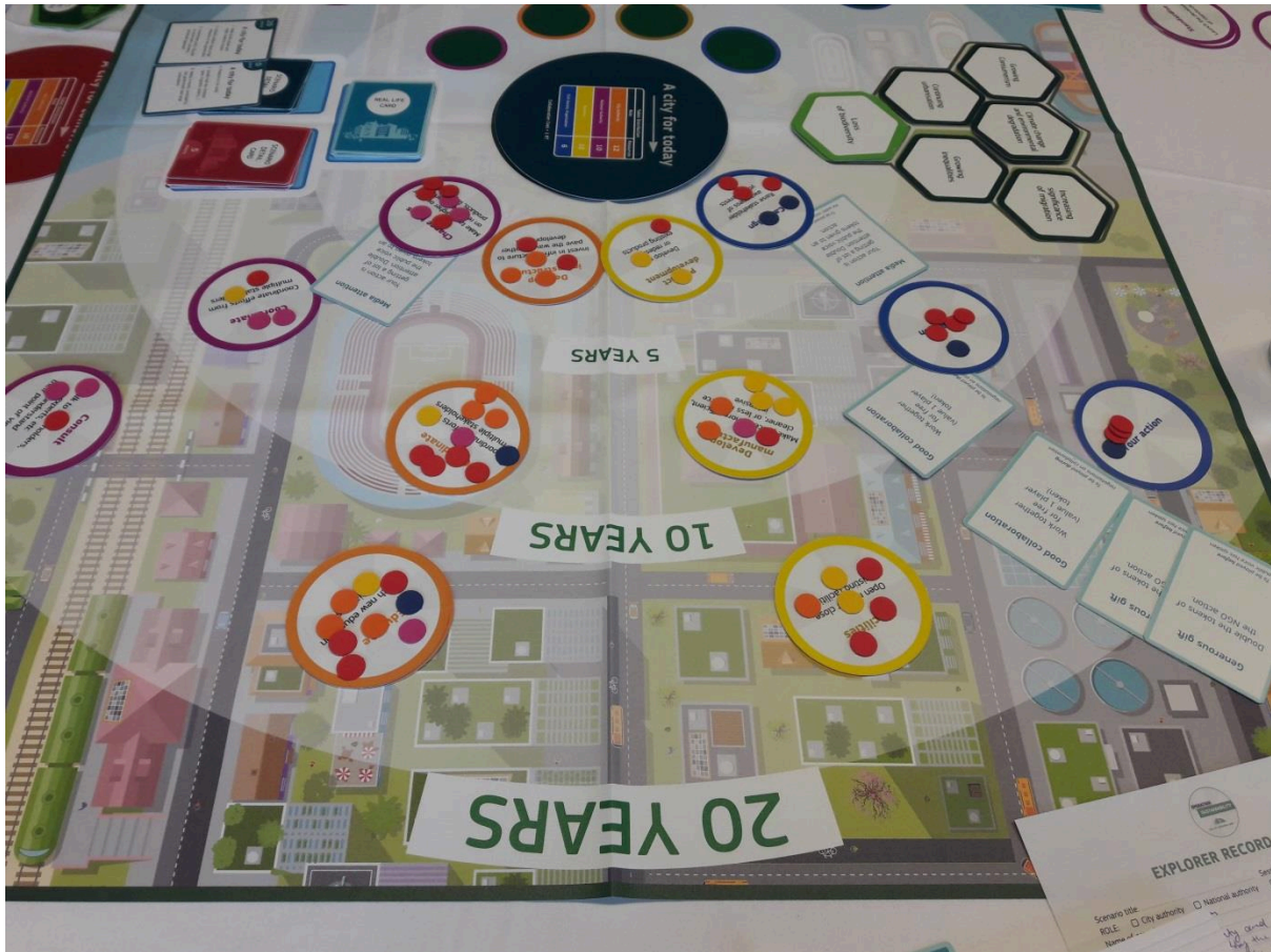
Figure 5: Illustration of the design applied to the "City Greening Game" edition of the Scenario Exploration System