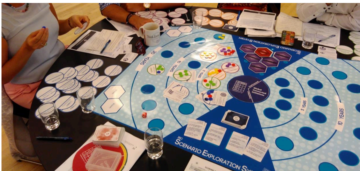
Figure 2: A scenario exploration in progress

The fact that the SES is based on future scenarios creates a safe space to simulate possible responses connected to any issue of interest to the participants. Its set up is a vast oversimplification of reality but it still provides enough complexity to challenge participants in a way that is usually perceived as realistic. Also, the fact that 'scenario explorers' only have a limited amount of resources to spend over their complete exploration and can only take one action per round focusses minds and pushes them to set priorities and be strategic. Figure 2 (below) illustrates a scenario exploration in progress.