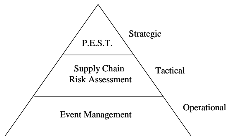
Figure 3 : Supply Chain Knowledge

The third level of knowledge is operational and pertains to the day-to-day management of the business. The emerging field of Supply Chain Event Management (SCEM) is potentially of great value in this regard [17].