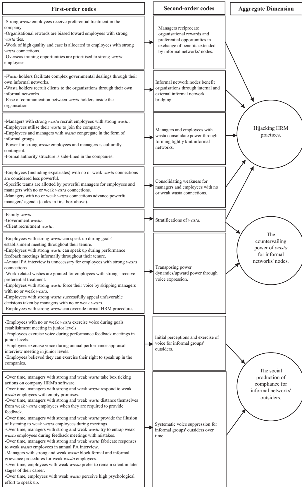
FIGURE 1 Data structure.