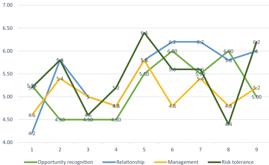
Fig. 3 The average values of four entrepreneurial self-efficacy dimensions (opportunity recognition, relationship, management, risk tolerance) based on Wei et al. (2020) ( N = 9 )

only one participant had the lowest average value (4.2). The management dimension also received relatively high average values (above 4.6). Interestingly, the majority of participants have indicated that they do manage risks (the average values are above 5.2), except for two participants (see Fig. 3). In sum, the results suggest that the online i2i program has raised the participants' entrepreneurial self-efficacy.