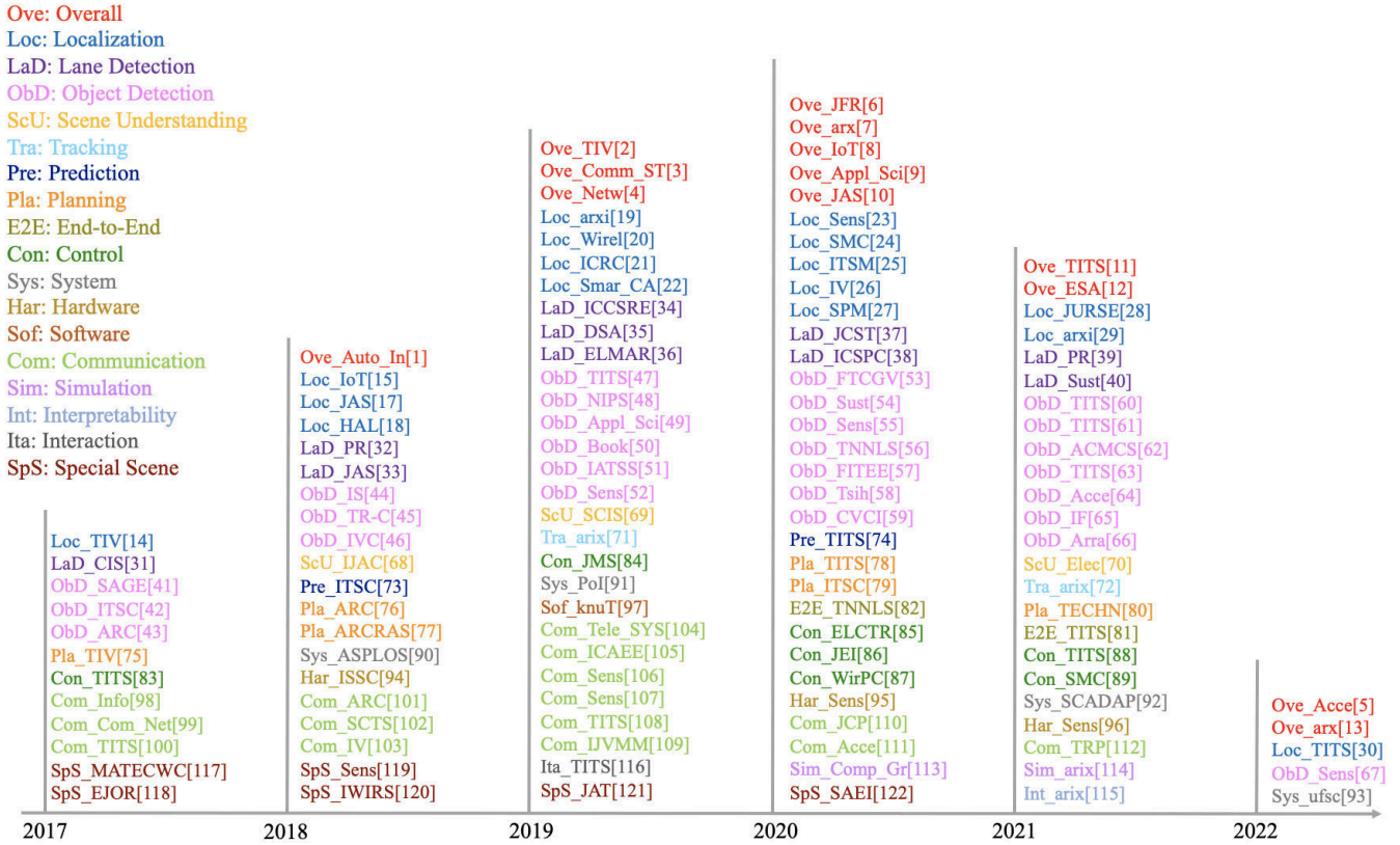
Fig. 1. We provide all the collected papers on the time axis with abbreviations, consisting of the categories, published journals and the serial number.