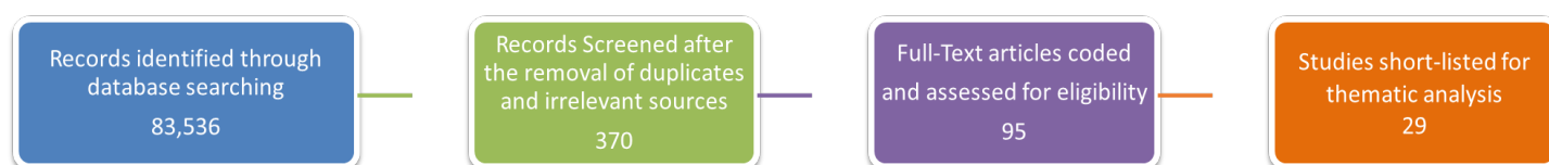
Figure 1: Flow diagram of the search procedure for the systematic review

("Irish Republican", OR "dissident republican"), AND (rehabilit*, OR "exit", OR "leaving")