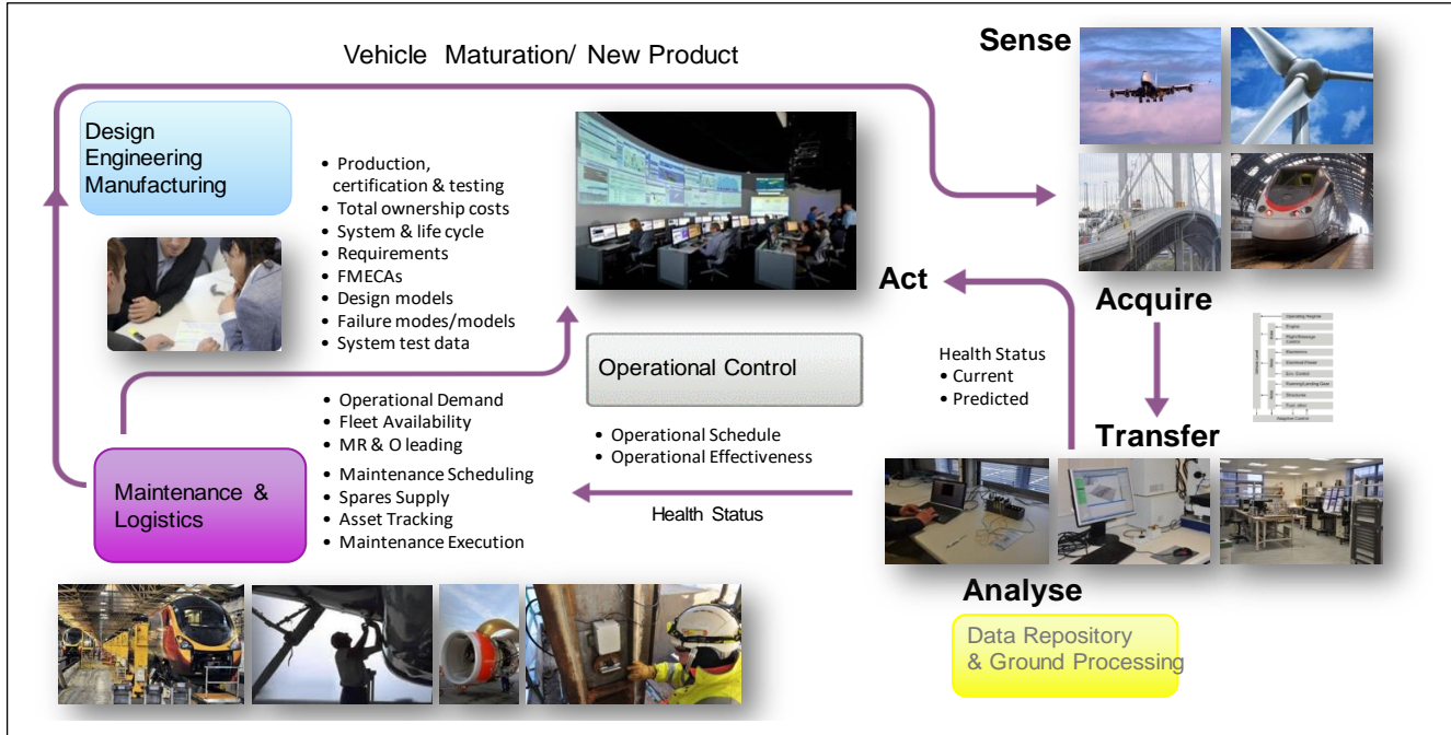
Figure 1: The role of IVHM in product lifecycle [7]

manufacturing and maintenance-logistics. Once the data is acquired, they are transferred using high-end communication technologies to analyze the health information collected from the data. The IVHM system needs high computational speed for processing all the data collected and depends upon advanced machine learning algorithms and AI for diagnosing faults and predicting the remaining useful life of the systems. This information on the system's health is provided for maintenance of the vehicle (as shown in Fig. 1), under the CBM program.