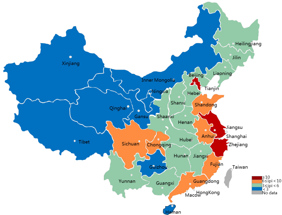
Figure1: Regional IPI Distribution