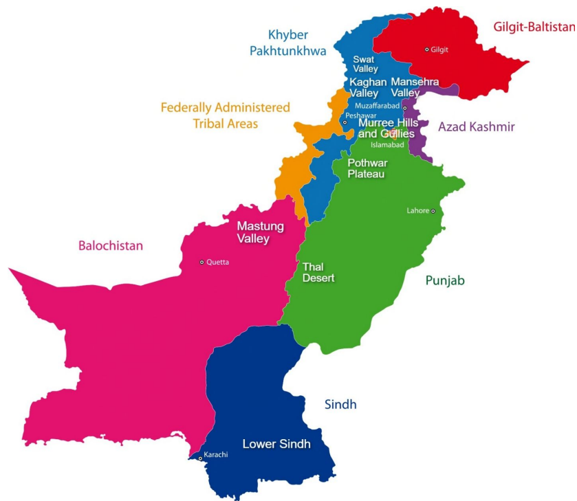
Fig. 2 Map of Pakistan indicating agroforestry initiatives taken at various locations. Map modified after Nile TV International (2019)