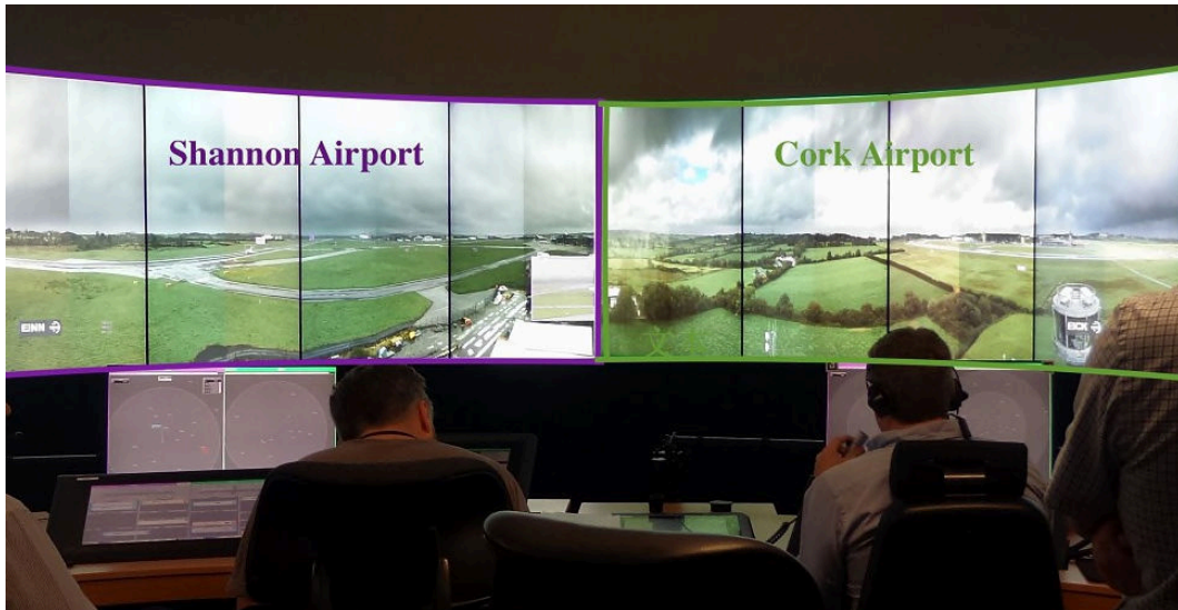
Figure 2. The augmented vision of out of window view for multiple remote tower operations including infra cameras, pan tilt zoom and radar information for different airports shown by different colours on the boarder of displays (Green for Cork airport, Purple for Shannon airport)