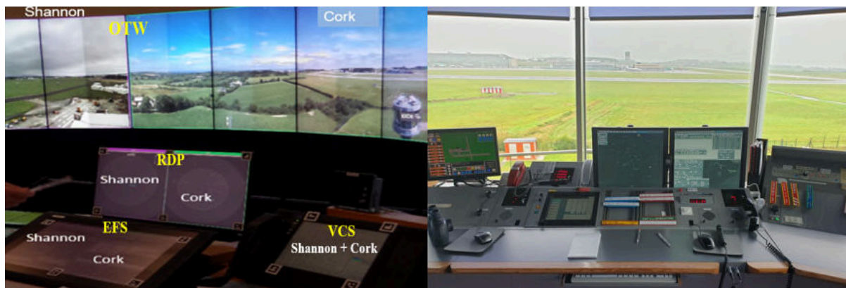
Figure 1. The Controller Working Position consisted by OTW, RDP, EFS and VCS for both Shannon and Cork airports located at Dublin airport on Multiple Remote Tower Operations (left) compared with the layout of traditional physical tower (right)