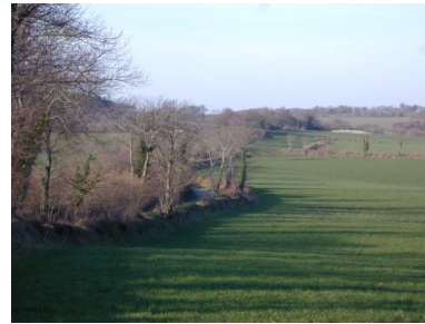
Bocage in Brittany, France