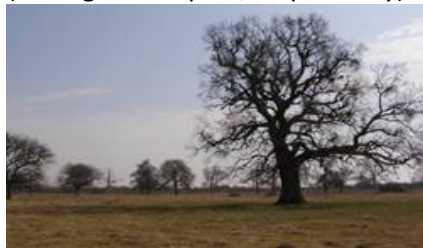
Ancient wood pastures in Hungary (Panonian)