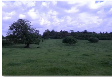
Wood pastures in UK