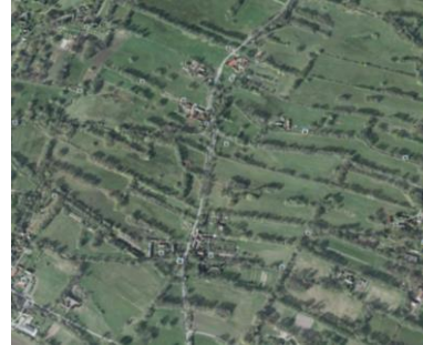
Hedged meadows in Spreewald floodplain of Germany Grazed woodlands