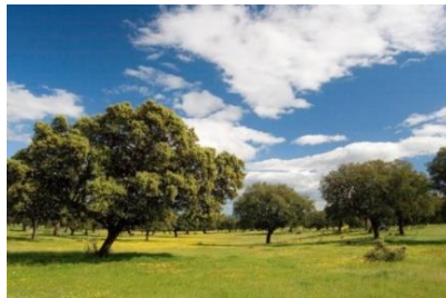
Iberian Dehesas and Montados (Portugal and Spain, respectively)