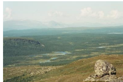
Woodlands grazed by reindeers in Sweden (Boreal)