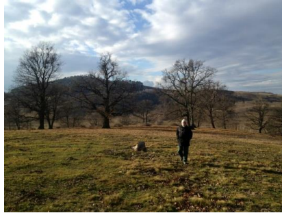
Ancient wood pastures in Transylvania (Romania)