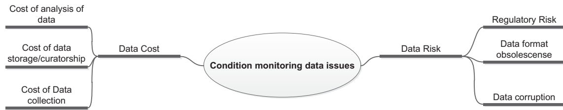
Figure 2: Cost/Risk of Condition monitoring data