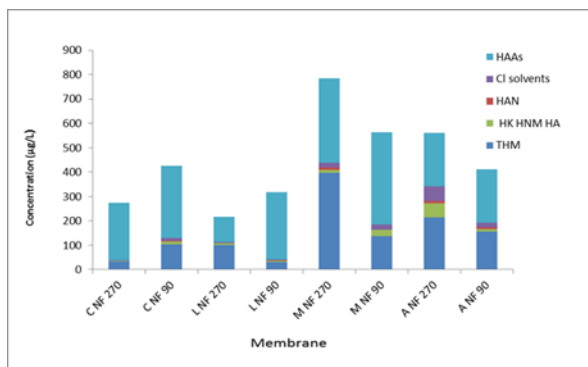
Figure 1.1 DBP-FP total of raw water after NF