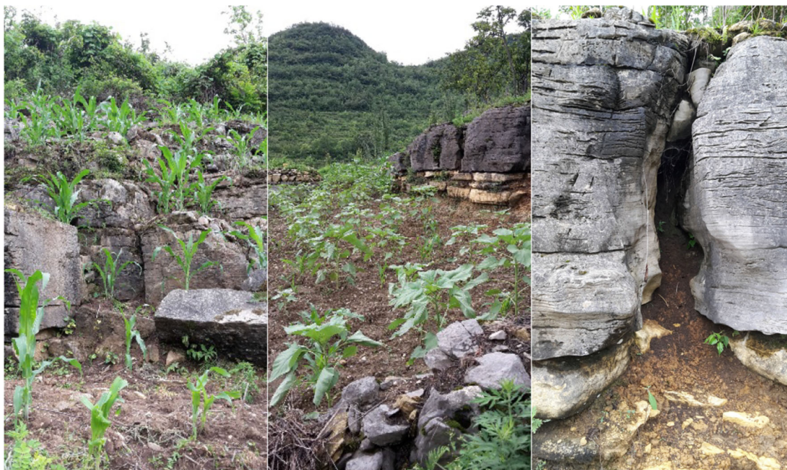
Fig. 2 The challenging terrain results in exploitation of pockets of soil as basement rock is exposed at the surface. Fissures in the limestone provide pathways for erosive runoff