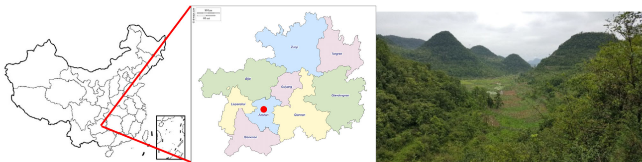
Fig. 1 Location of Chenqi, Guizhou, Southwest China and oblique view over the catchment

Twenty-seven soil profiles were exposed and each horizon in each soil profile was sampled. All horizon samples were analyzed for total carbon (TC), soil organic carbon (SOC) and total inorganic carbon (TIC). Additional higher-resolution depth-incremental samples were