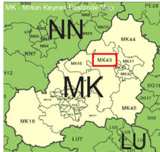
Figure 4 Postcode map of the area of Milton Keynes with the corresponding districts