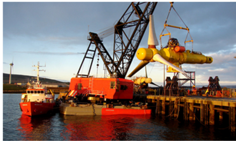
Fig. 2. Ocade's 18 – 1.4 MW turbines commercial deployment.

Alstom [23] bought Rolls-Royce's Tidal Generation Ltd (TGL) in 2012. They installed and tested a 0.5 MW turbine at the EMEC at Orkney. The turbine design is the closest to wind turbines, with a hermetic nacelle where the gearbox is connected to a generator probably with a coupling. TGL also installed a 1 MW turbine in Orkney in 2013. It is connected to the Scottish grid. Alstom is a participant of ReDapt project (Reliable Data Acquisition Platform for Tidal) which is co-funded by ETI (Energy Technologies Institute). Alstom started designing Ocade 18, a 1.4 MW turbine with 18 m rotor in 2014 (Fig. 2).