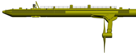
Fig. 3. SR2000 Operation Mode.

OpenHydro [34] is developing an open core turbine which is an uncommon configuration. OpenHydro's 1 MW device (Fig. 4) was installed in the Bay of Fundy, Canada at the end of 2009. The device was damaged and put out of action due to blade failure in spring of 2010. The machine was recovered in December 2010. The cause of the failure is unknown, and the event damaged the progress and commercial reputation of OpenHydro (this type of failure and the consequential lost revenue clearly demonstrates a need in the market for condition monitoring technology). As of April 2015 OpenHydro has won $6.3M for the development of a tidal array in Canada [35].