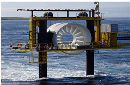
Fig. 4. OpenHydro's commercial deployment.