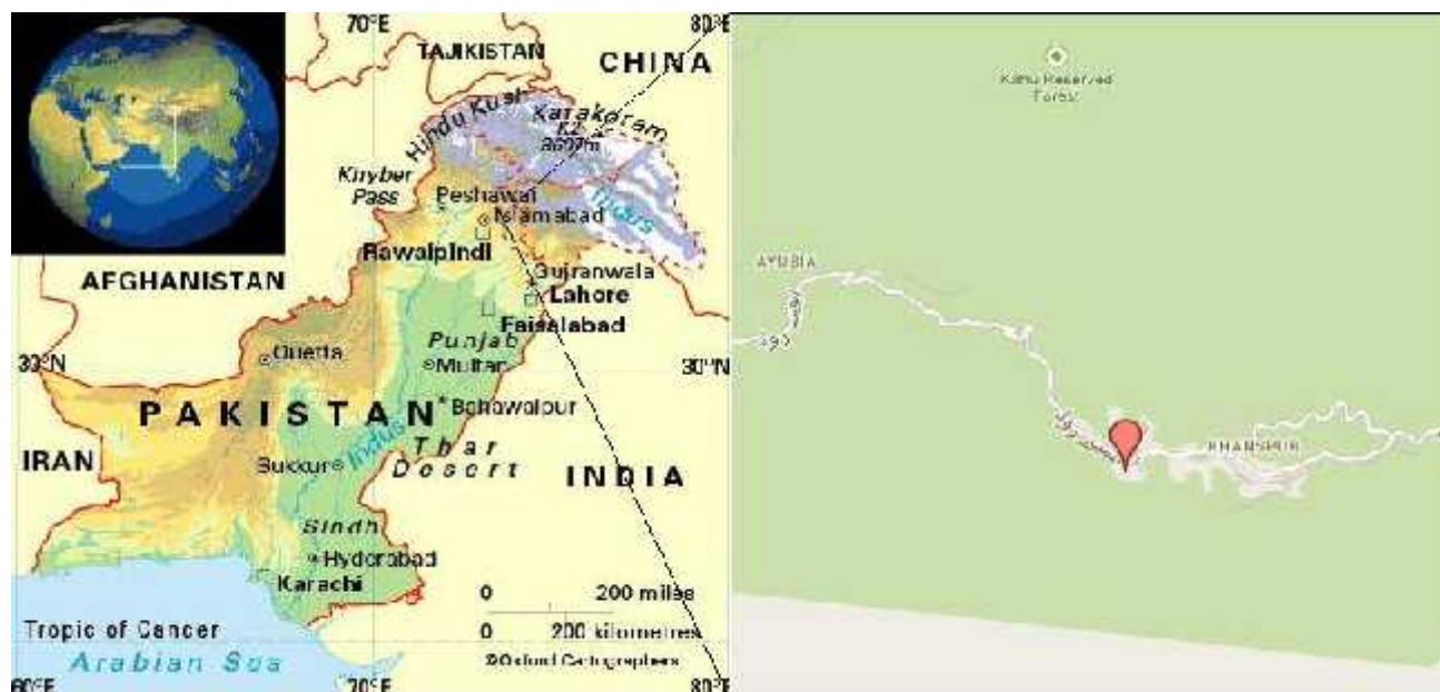
Figure 1: Location of monitoring site, Sir Syed Campus, University of the Punjab, Khanspur

Punjab in order to monitor the seasonal variation in concentration of particulate matter. Sir Syed Campus, University of the Punjab (N 34 01' 14" E 073 25' 09") is a field facility in Khanspur to support study tours and field research projects (Figure 1).