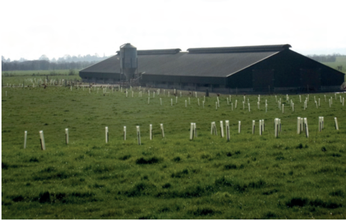
Figure 3. Commercial free-range egg producers, such as this example in Lincolnshire, are planting trees to provide shelter and improve hen welfare.

benefits of agroforestry should help ensure that the UK has a joined-up approach to multi-functional land use. Some of these benefits are considered in the second part of this article.