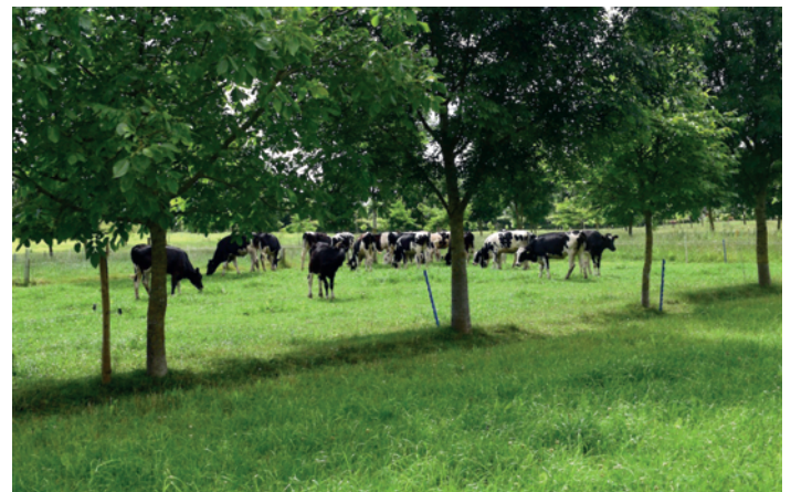
Figure 4. The silvopastoral paddock-grazing system for dairy heifers operated by Peter Aspin in Shropshire.

The UK is one of the windiest locations in Europe and trees in pasture can provide shelter thereby reducing animal suffering during extreme weather and improving survival and productivity. Examples of shelter include forest grazing, wood pasture, parkland, and shelterbelts. Gregory (1995), reviewing research in New Zealand, quotes Egan et al. (1972) who showed that lamb mortality in the first 48 hours decreased from 20% to 7% in the presence of a 5-8m cypress hedge. Gregory (1995) also quotes Alexander and Lynch (1976) who showed that the growth rate to 21 days of age in lambs from sheltered paddocks was 7% greater than for unsheltered lambs. Lastly, Gregory (1995) quotes research indicating that adequate livestock shelter may require 3% of the land on flat or gently undulating slopes, whereas as much as 20% may be required in hill areas. In the UK there are tools such as the 'Farm Shelter Audit' that help to identify the potential benefit to farms of different types of shelter (Hislop et al., 1999).