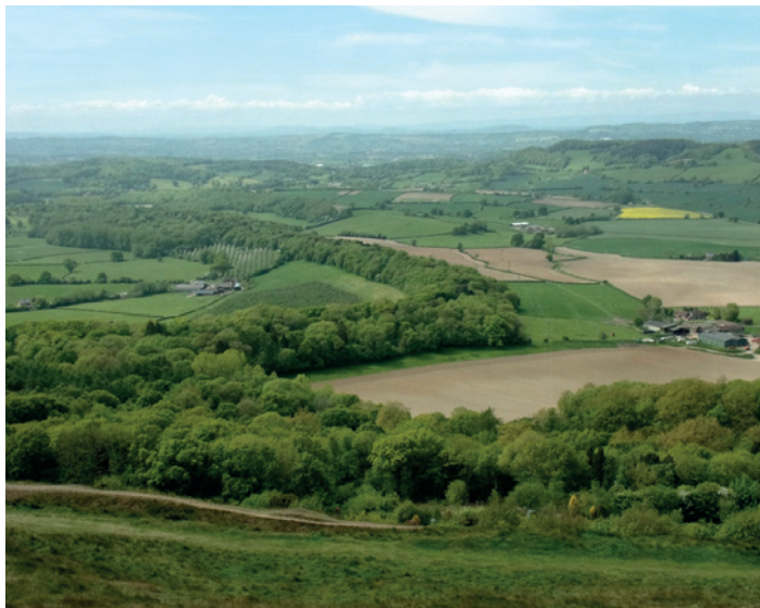
Figure 1. Many parts of lowland England, for example Herefordshire, have an agroforestry landscape.

records multiple land use) to determine the extent of agroforestry in each European country. For the UK they calculated that multifunctional land use involving trees with either grazing or crops occupies about 552,000ha, i.e. similar to the area of oilseed rape (650,000ha). Petit et al. (2003) also report that there are 468,000km of hedgerows in Great Britain with an additional 138,700km comprising lines of trees and shrubs.