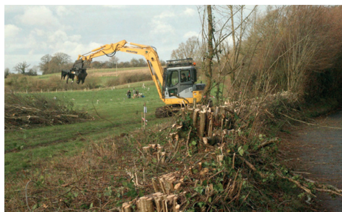
Figure 5. The Organic Research Centre has provided guidance on the use of hedges for woodfuel.

Whereas the UK is currently about 60% self-sufficient in food (Defra, 2016), it is only 20% self-sufficient in wood products (Forestry Commission, 2016). Appropriate management of trees on a farm can provide a means of both increasing fuelwood supply and/or to store carbon. Work by the Organic Research Centre has highlighted how up to 50% of hedges on a farm could be managed for woodfuel (Chambers et al., 2015) (Figure 5). The planting of trees on pasture or crop land on mineral soils in the UK consistently results in an increase in overall carbon storage. This is because of the increased above- and below-ground carbon stored by the trees, even though the effects of tree planting on soil carbon may initially be variable (Beckert et al., 2016; Saunders et al., 2016; Upson et al., 2016). A particular source of carbon loss in the UK is from the peat soils of Eastern England with typical annual rates of soil loss of around 2.1cm reported by