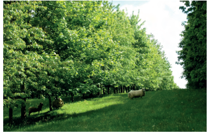
Figure 7. An agroforestry system, developed by Bill Ackworth in Berkshire, was a silvoarable system (i.e. trees with an arable crop) in 2001 (left), but in 2015 the grass below the trees was being grazed by sheep (a silvopastoral system) (right). The trees are being grown for timber and pollarded for firewood.