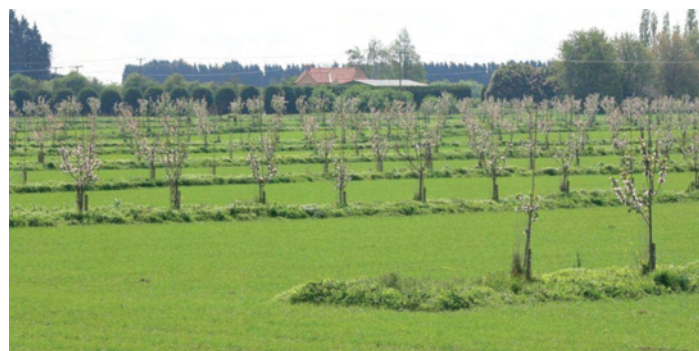
Figure 6. Stephen Briggs of Whitehall Farm, near Peterborough, has planted apple trees and wildflower strips at a 24m spacing to provide an additional crop, protect the soil, and enhance biodiversity within an organic cereal system.

A key role that can be played by trees in a farmed landscape is the reduction of runoff. At Pontbren in Wales ten hill farmers have worked together to improve the productivity and environmental effects of about 1000ha comprising improved pasture and woodland (Wheater et al., 2012). Experiments at the site have demonstrated that areas planted with trees had higher rates of infiltration (Carroll et al., 2004). Using the data from the detailed field measurements at Pontbren, Wheater et al. (2012) have also predicted the effect of tree planting on water flows from a 400ha sub-catchment. Relative to a baseline scenario, removing all trees increased the median flood peak by 20%, adding tree shelterbelts reduced the peak by 20%, whilst full afforestation reduced the peak by 60%. Whilst Wheater et al. (2012) note that these changes were reduced for more extreme flood events, the results highlight that tree planting can reduce runoff and flooding for 'median' events. In South West France agroforestry is also being promoted at a larger scale to improve flood management and reduce soil erosion as part of the Agr-eau project in the Adour-Garonne watershed (Balaguer, 2016), an approach that it would be good to replicate in the UK.