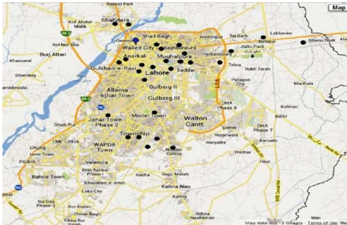
Fig. 1. Map of Lahore, black dots indicates the location of schools

Sampling Site: Lahore is the most populous city in Punjab Province, Pakistan covering a total area of 1772 km 2 . It is located between 31°15' and 31°45' N and 74°01' and 74°39' E. Under the administrative government, Lahore is divided into different areas called as towns.