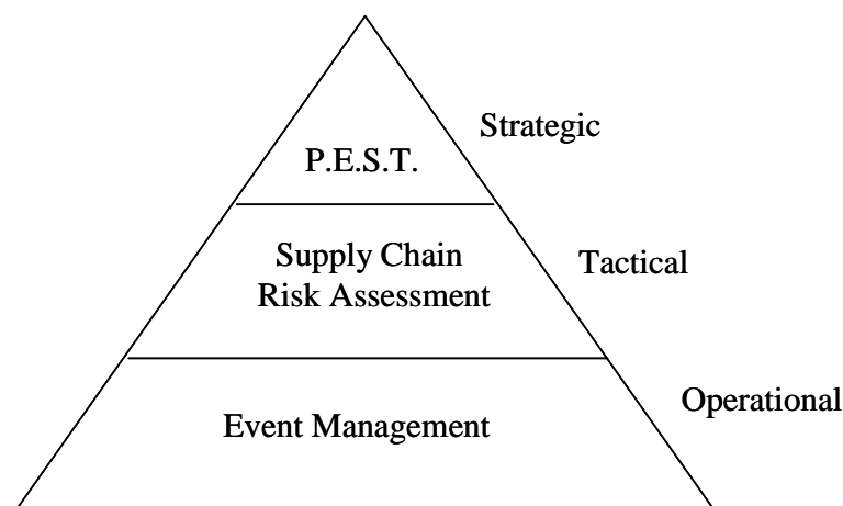
Figure 3 : Supply Chain Knowledge

The third level of knowledge is operational and pertains to the day-to-day management of the business. The emerging field of Supply Chain Event Management (SCEM) is potentially of great value in this regard [17].