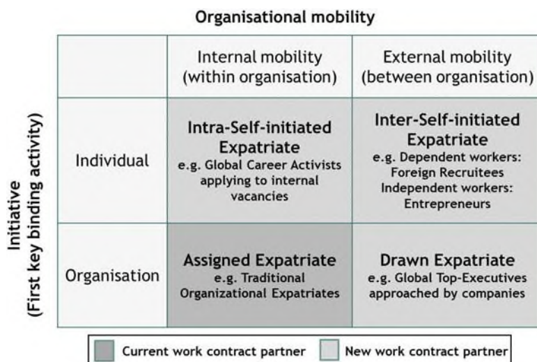
Figure 3. Typology of internationally mobile employees.

We have argued that, in the case of SIEs, the initiative always comes from the individual and that the decision to employ an SIE is always made by a new work contract partner. In contrast, an AE is initiated by the current organization that takes the first key binding action by offering an employment contract for a temporary work assignment abroad. This process tends to uphold the legal anchor to the current work contract partner in the home country.